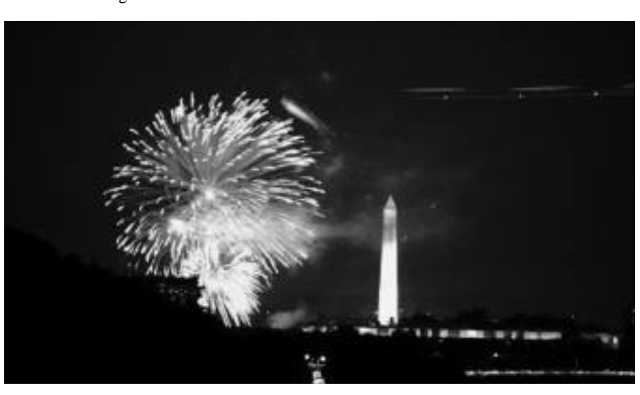
A closer look at the three lights over the Washington Monument, July 4, 2002.

"This group of objects started to cruise south toward the National Mall. At this point I yelled for my wife to come to the bathroom. 'Get in here now! You have to see this weird thing in the sky!' I pointed it out to her and she watched with me as we tracked it moving east to west over The Mall, over the Washington Monument, toward the Lincoln Memorial, and off toward the Pentagon area.